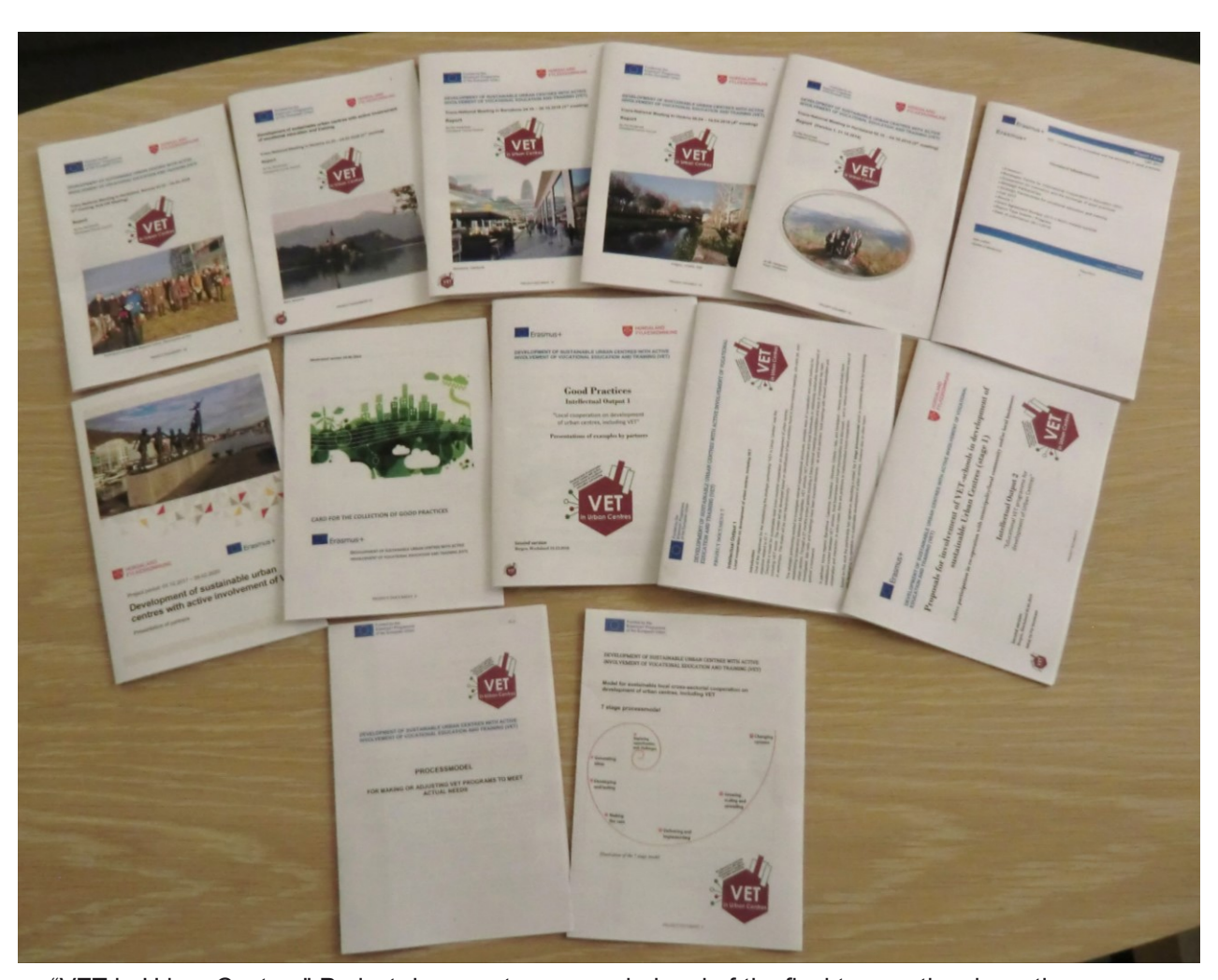
"VET in Urban Centres" Project documents prepared ahead of the final transnational meeting