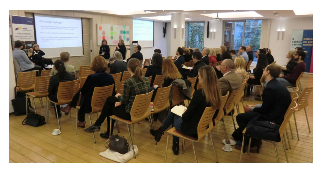
"VET in Urban Centres"; Multiplier Event at Norway House, Brussels